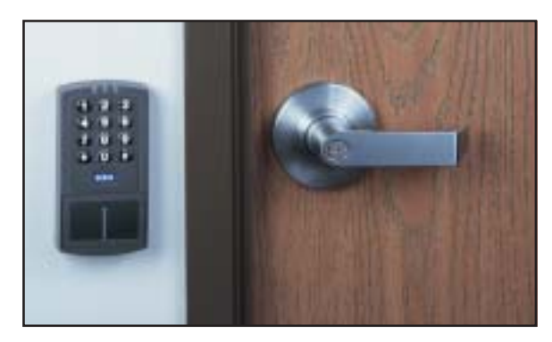
Control unit shown mounted in a typical configuration.